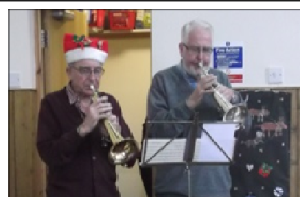
Festive Carols were played at Time Out's Christmas Lunch in Highburton