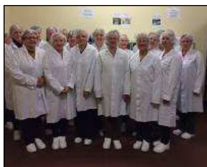
Stocksmoor WI's Trip to Thorntons