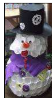
Snowman made by Highburton Brownies