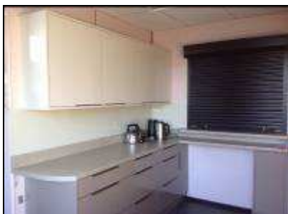
Stocksmoor Village Hall Association's new kitchen