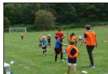
Shelley Community Football Club

Some of the remaining budget has been put into the Allocated Reserves to cover grants paid out after the financial year-end.