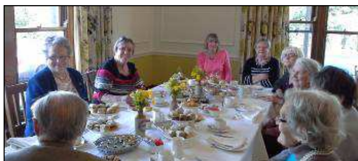
Shepley Good Companions – AGM Afternoon Tea at Cliffe House