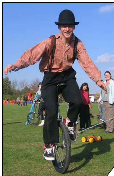
Shepley Spring Festival