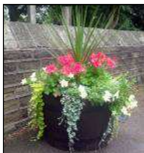
New Planters in Kirkheaton

If you have any ideas for new projects, please get in touch.