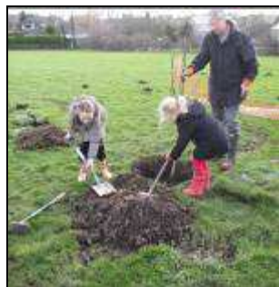
Creation of the 'Forest School' at Highburton