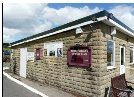
Thurstonland Cricket Club – Repairs to the roof