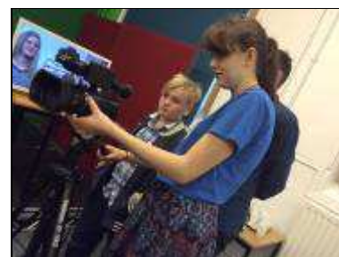
Kirklees Local TV Media Project