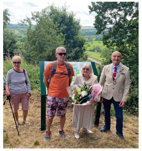
Representing our Parish