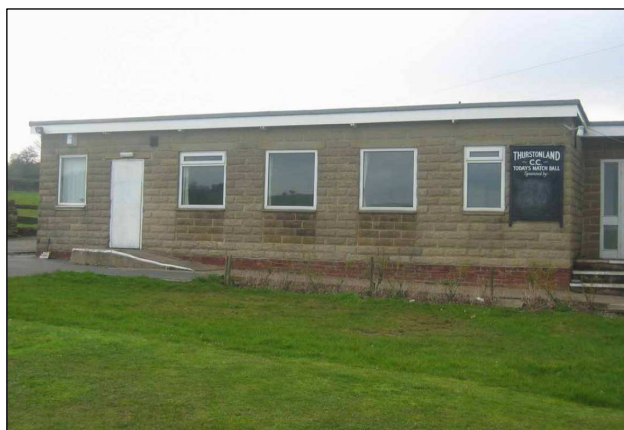
Thurstonland Cricket Club