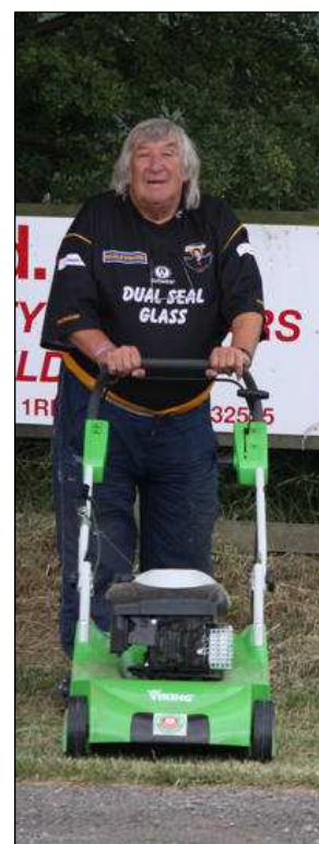
New mower for Flockton Cricket Club

£200 clock maintenance grants are awarded to all churches with clocks – have you applied for yours yet?