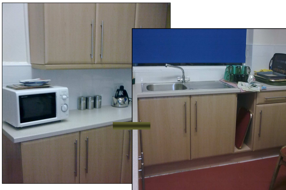
New Kitchen for Kirkheaton Luncheon Club