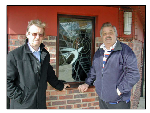
Lepton Methodist Church: Improvements to the kitchen & also to the entrance

Grants: The various grant schemes have proved even more popular this year with the total representing an all-time record for the Council.