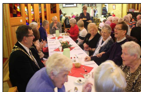
Lepton Luncheon Club's Christmas Lunch 2015 supported by a small annual Parish Council grant.

Start-up grants were awarded to support new groups needing help to get going. The latest beneficiaries are Kirkheaton Knitting Group for £100 to contribute to venue rental costs and Stocksmoor Table Tennis Club for £100 towards hall hire costs and replacing equipment. Defibrillator grants of £850 each were also awarded to Grange Moor Community Association and Lepton Community Link