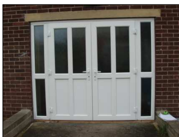
New doors for Kirkheaton Scouts & Guides HQ.

The support to community organisations through the grants schemes has continued: a total of £44,839 was awarded in grants to a wide range of organisations supporting all kinds of projects, as well as just lending a hand to keep small groups functioning, and providing a valuable service to their villages. A selection of projects supported are shown throughout the newsletter.