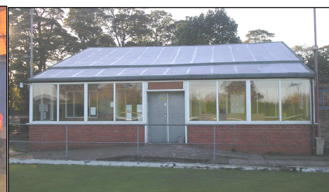
Pictured above (left to right) Grange Moor allotments, Lepton Youth Club and Farnley Tyas Bowling Club.